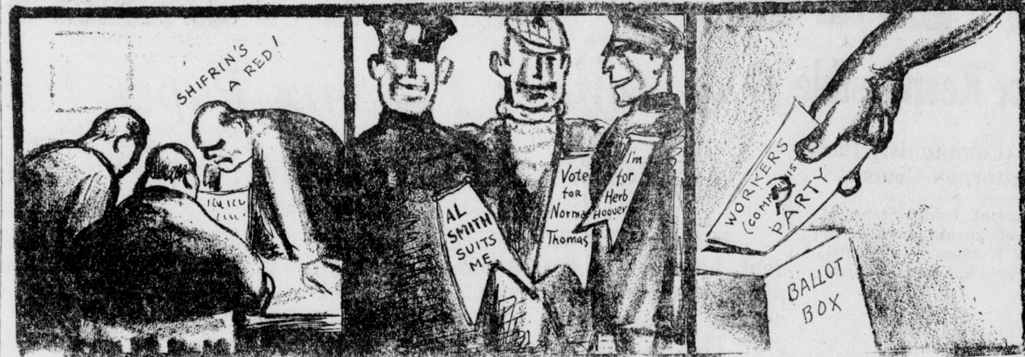
The "socialist" party, its publicity organs and lawyers providing the capitalist frame-up machine with the "evidence" it needs before it can stifle another class conscious vote.