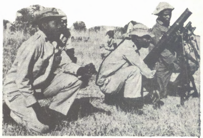
The Zimbabwean people know that the way to get rid of the white racist regime and the foreign imperialists is through people's war.