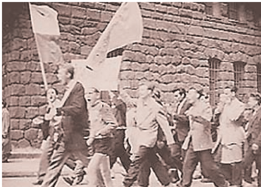
June 24 1956. Workers march out of factories