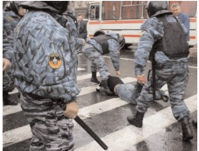
Moscow police attack Pride march, May 27

In Bucharest the second Pride March took place on June 3 with around 500 marching through the streets of the capital. But egg-throwing counter-demonstrators organised mainly by the Romanian Orthodox churches marred the day. The growth of visible homophobia in Eastern and Central Europe will be a key theme of the Europride events taking place in London at the end of June/beginning of July.