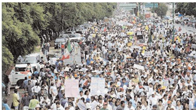
Mega march repudiates Ruiz Ortiz and paramilitary police violence