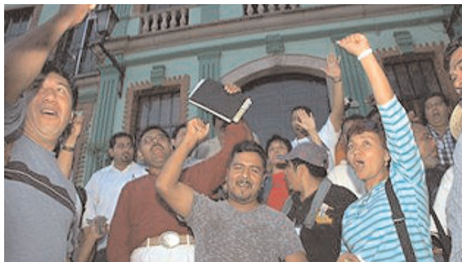
Oaxaca teachers greet release of their comrades

These actions, directly organised by the national intelligence committee chaired by President Vicente Fox, are widely seen as trying to create a 'strategy of tension' - a climate of fear aimed at discrediting the