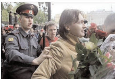
Moscow - a "21st century Stonewall"

defence team is attempting to argue there was no intention to murder and to have the charges reduced from murder to manslaughter.