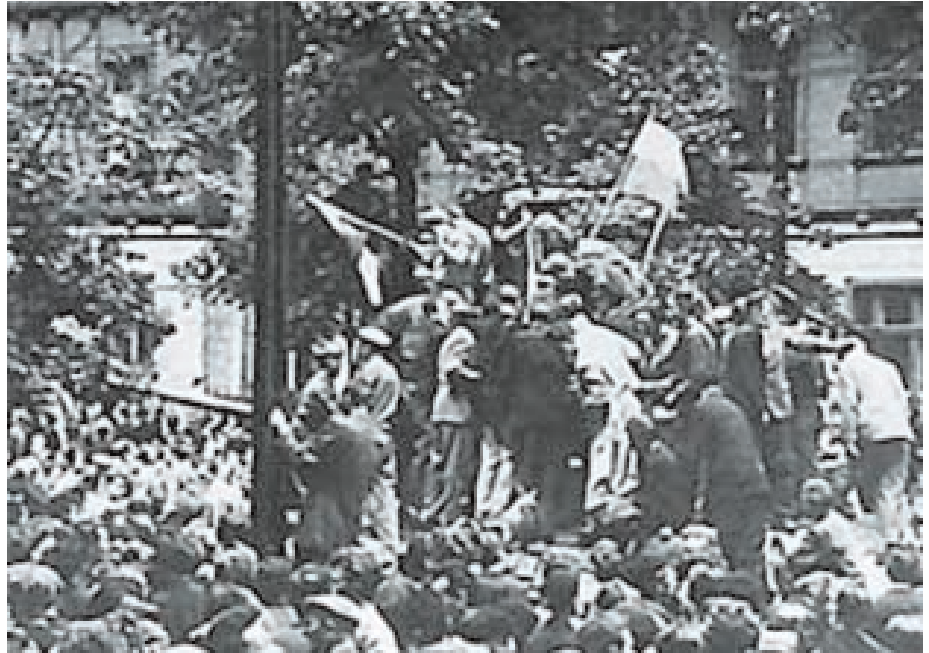
The first tanks to arrive are stopped by workers

From 4pm onwards the town was besieged, bit by bit, by a force of two armoured divisions and two divisions of infantry - a force totalling 10,000 soldiers and 360 tanks, under the command of the deputy minister of