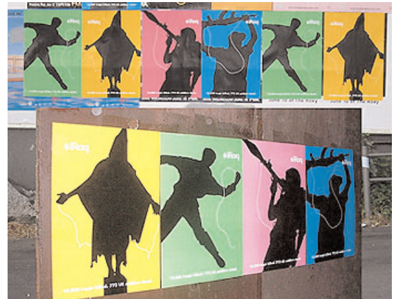
Spoof iPod adverts attack the war

SW: There's this sense that if the United States were to leave-now that the Ba'athists and Shi'ite militants are more organized than they were before, and that there's even splits within them with more radical elements within each sector, including the jihadists-that if there were even just redeployment or planned withdrawal, it would encourage them and all hell would break loose. And