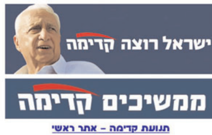
Kadima poster cashes in on the memory of Sharon

Histadrut was elected as the leader of the Labor Party, and declared war on the neo-liberal economics, all the candidates were obliged to at least pay lip service to social reforms, including even Ehud Olmert who replaced Netanyahu as Minister of Finance and continued his criminal policy.