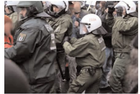
Police attack demonstrators, 3 June

On May 20th in Kassel, right in the geographical centre of Germany, there took