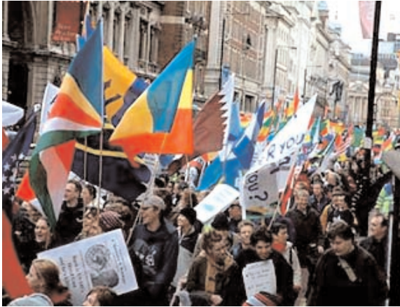
Climate change demo December 2005, London

While some individuals and currents have advocated a “productivist” road while quoting Marx as their source, not only do Marx and Engels writing show a concern for the environment but there is a long history of Marxist writing and activism on the subject, much of which has been buried by the legacy of Stalinism, like so much else.