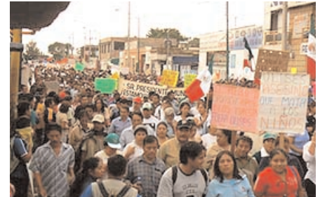
Teachers march in Oaxaca

because "another world is not possible within capitalism."