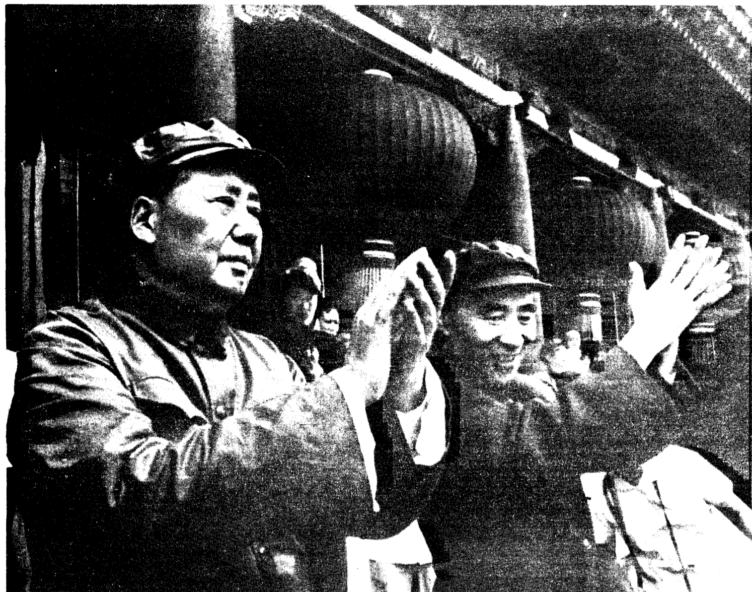
Mao Tse-tung (left) and Lin Biao applaud Red Guard demonstration in Peking, August 1966.

However, China was simply too poor to apply the Soviet method for rapid economic growth. Compared to the Soviet Union in 1929, China in 1953 produced roughly one-half as much food per person. A reduction in food output comparable to that which occurred in Russia during the 1930's would literally have produced mass starvation in China. The conflict between China's poverty and orthodox Soviet-Stalinist industrializa-