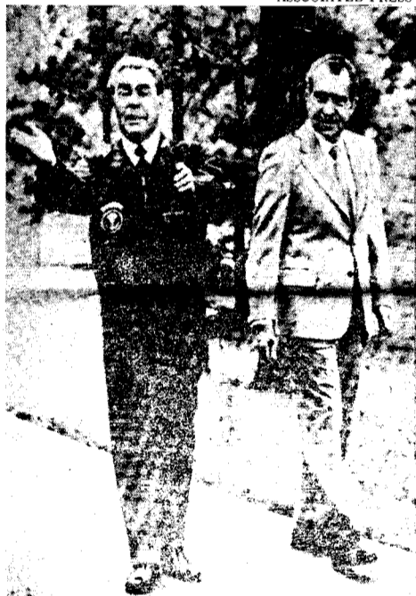
Brezhnev clowning during June visit to U.S.

In themselves, appeals to "world public opinion" are not unprincipled, as revolutionaries will even use bourgeois parliaments and the bourgeois press to make their views known to the masses of workers. Trotsky used the platform offered by the bourgeois press many times to expose the bureaucracy and was even willing to appear before the reactionary Dies Committee of the U.S. Congress. But the Soviet oppositionists appeal to bourgeois public opinion as a strategy rather than making use of a podium to reach the world working class. Like Pushkin's Aleko (in The Gypsies ) who "wanted freedom only for himself," they want democracy only for themselves and are willing to ally with bourgeois forces to attain it. Of course their illusions about the nature of the UN were learned in the Stalin-Dimitrov school of anti-Marxism, but to make excuses for these illusions and even paint them up as proletarian internationalism is a tremendous disservice to socialist militants in the Soviet Union and Eastern Europe who are genuinely seeking a revolutionary strategy.