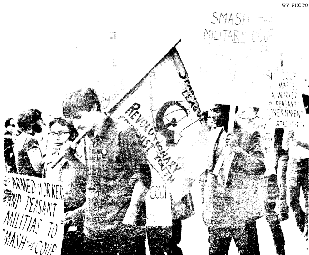
SL/RCY demonstrate in Boston.