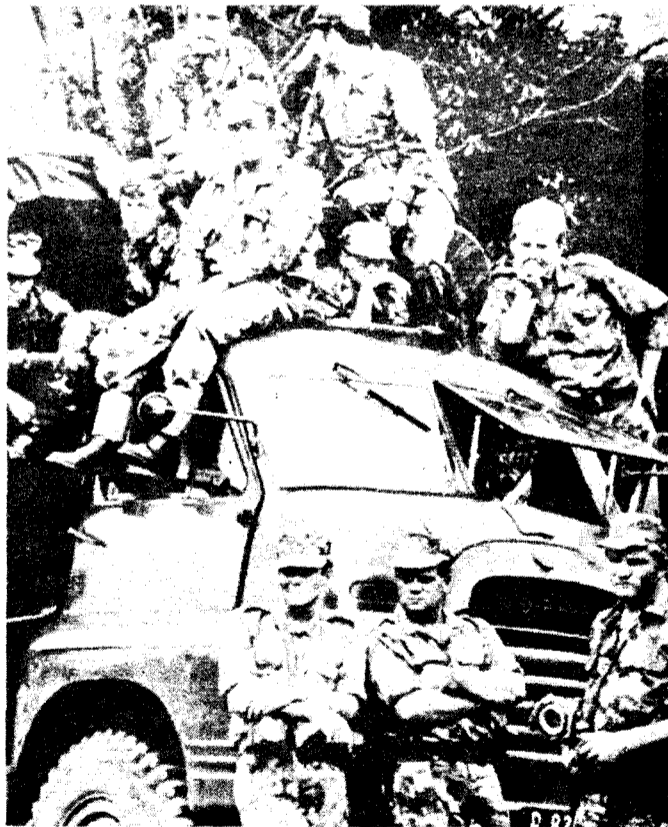
South African soldiers on duty during strike wave earlier this year.

In all cases, however, the key to success is intransigent revolutionary struggle to unite the vast majority of the working class around the Trotskyist program of permanent revolution and under the leadership of the Bolshevik-Leninist party—the struggle, in short, to reconstruct the Fourth International. ■