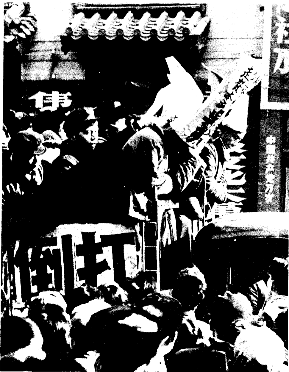
Maoist solution to "low consciousness."