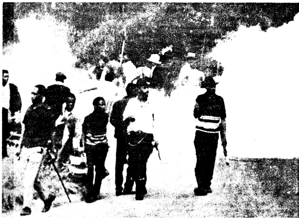
Police fire tear gas on workers in Durban, South Africa during February strike.

The government initially encouraged peaceful settlement of the strikes, partly because of the tight labor market, but also because they were virtually unorganized and leaderless, making them difficult to suppress without a massacre. It even announced in May that legislation giving many Africans the legal right to strike for the first time since 1942 would be introduced. On the other hand, this right would not extend to "essential services," public utility and government bodies, and a 30-day "cooling-off" period is required. Because of the continued existence of pass regulations, the fact that many mine workers are foreigners from Mozambique, the labor-contract system, the lack of organized trade unions and strike funds, it is unlikely that such legislation will