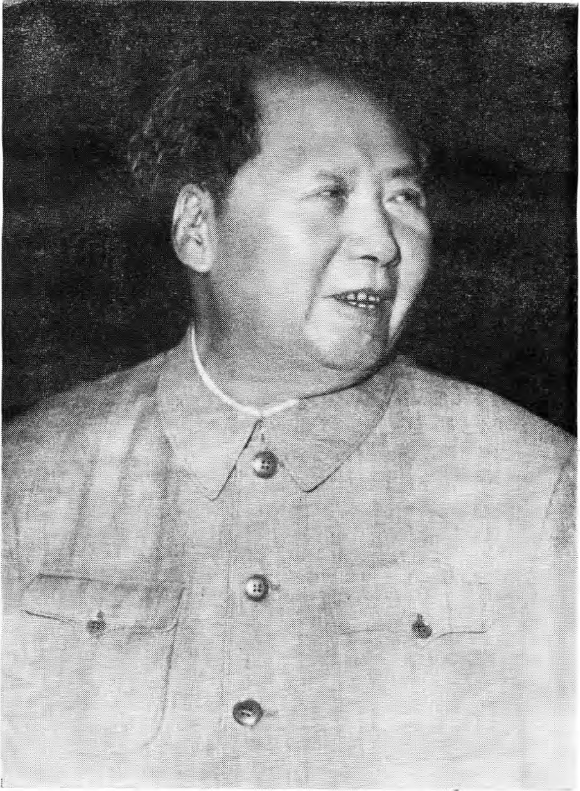
Our respected and beloved great leader Chairman Mao, in high spirits and smiling broadly, with warmth and affection met more than 20,000 revolutionary fighters on May 20.