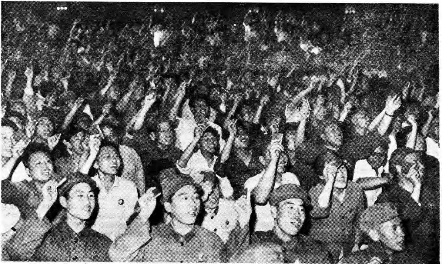
Thousands of red hearts beat excitedly and thousands of smiling faces turn to the red sun. From the bottom of their hearts, the revolutionary fighters wish our great leader Chairman Mao a long, long life!

They declared: "Chairman Mao is the red sun in our hearts. Tens of thousands of words are inadequate to describe our love for him; nor are tens of thousands of songs adequate to express our esteem for him. We will hold the great red banner of Mao Tse-tung's thought still higher, advance from victory to victory, and seize all-round victory in the great proletarian cultural revolution, the first of its kind in the history of mankind."