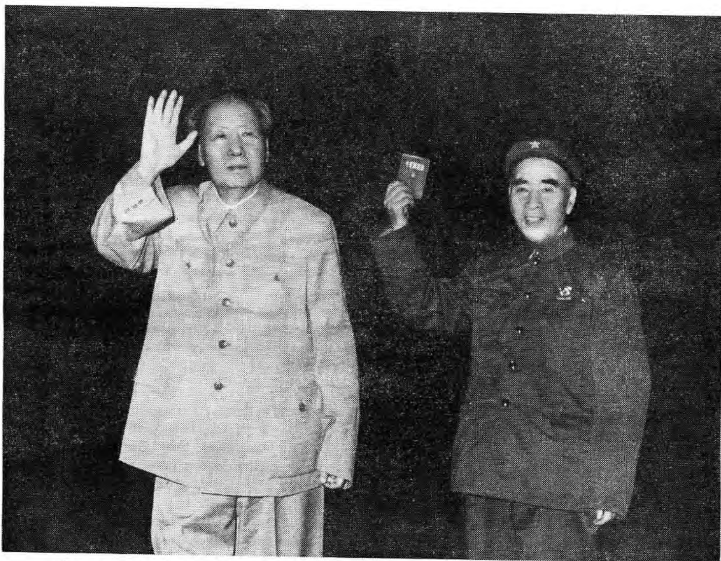
Our great teacher and great leader Chairman Mao and his close comrade-in-arms Vice-Chairman Lin Piao warmly greet the revolutionary fighters from all parts of the country.

Our great leader Chairman Mao and his close comrade-in-arms Vice-Chairman Lin Piao and Comrades Chou En-lai, Chen Po-ta, Kang Sheng, Li Fu-chun, Chiang Ching, Yao Wen-yuan, Hsieh Fu-chih, Huang Yung-sheng, Wu Fa-hsien, Yeh Chun