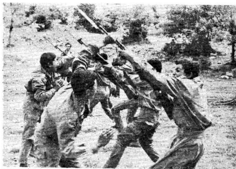
Palestinian guerrilla fighters training for close-range fighting against the enemy.