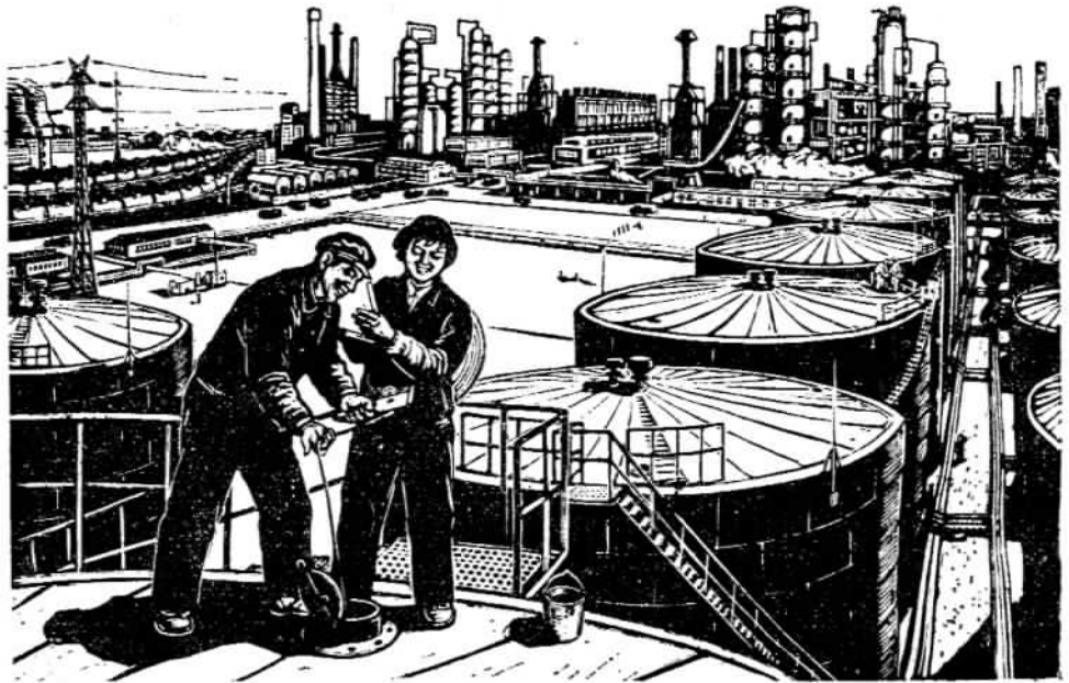
In the Takang Oilfield.

The No. 2 team of the No. 1 oil producing section has 230 members, over one-third of them are young women. Deputy team leader Chen Ming-chen is 21. In the past, oil extraction workers were mainly responsible