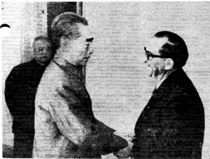
Premier Chou En-lai meets Prime Minister Dominic Mintoff.

Chinese Foreign Minister Chiao Kuan-hua and Dutch Foreign Minister M. van der Stoel held talks on January 4. Foreign Minister Chiao