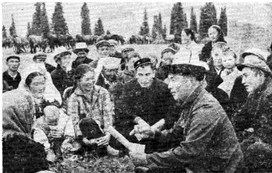
A Kazakh cadre gives a talk on the history of the struggle between the Confucian and Legalist schools.

In the old days education was monopolized by a handful of herd-owners and wealthy persons, while the labouring people had no access