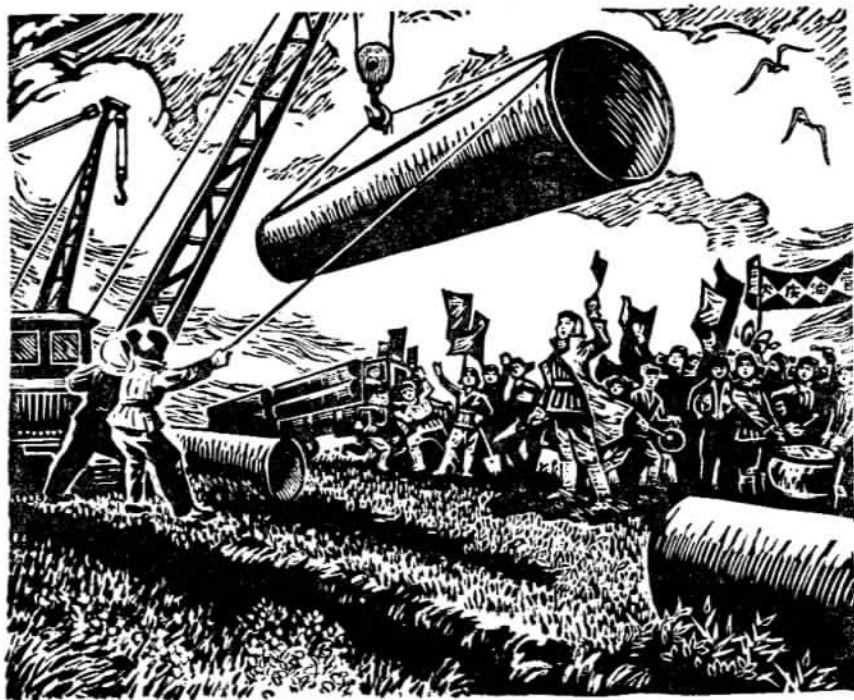
Another Section of the Oil Pipeline Being Completed.

by the amateur graphic art group of Chihuahangtao workers and staff