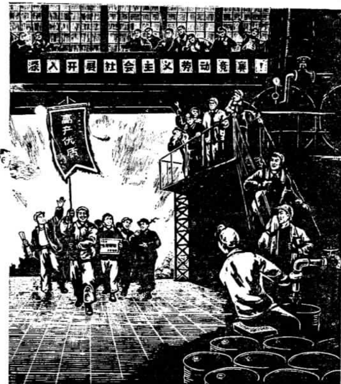
An Advanced Collective in the Refinery's Socialist Emulation Drive.

Since the opening up of the Taching Oilfield in the early 1960s, the Great Proletarian Cultural Revolution which started in 1966 has further promoted the growth