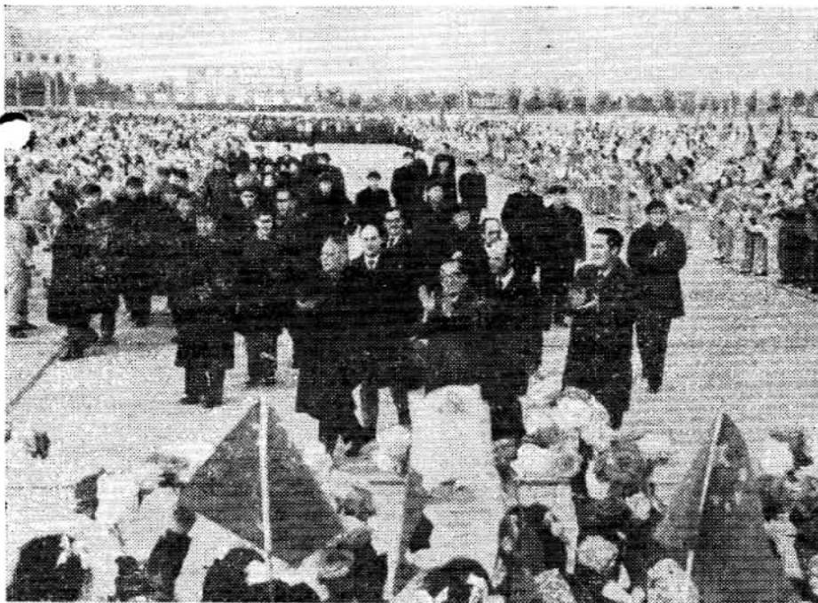
A rousing welcome at Peking Airport for Prime Minister Dominic Mintoff.