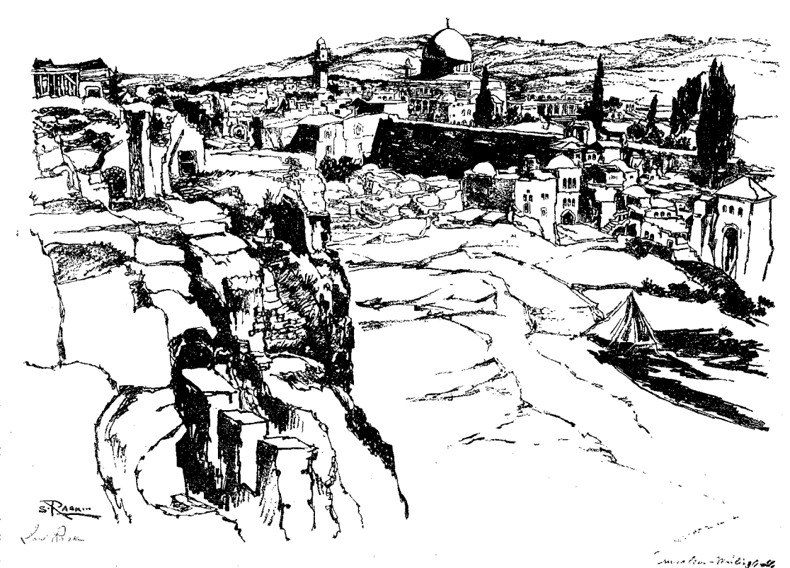
JERUSALEM—THE WAILING WALL IN MIDDLE DISTANCE