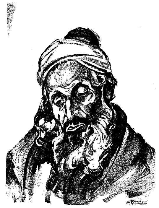
A JEMENITE JEW

Well maybe, but it sounded inconclusive. I asked an Arab about it-"It isn't that we