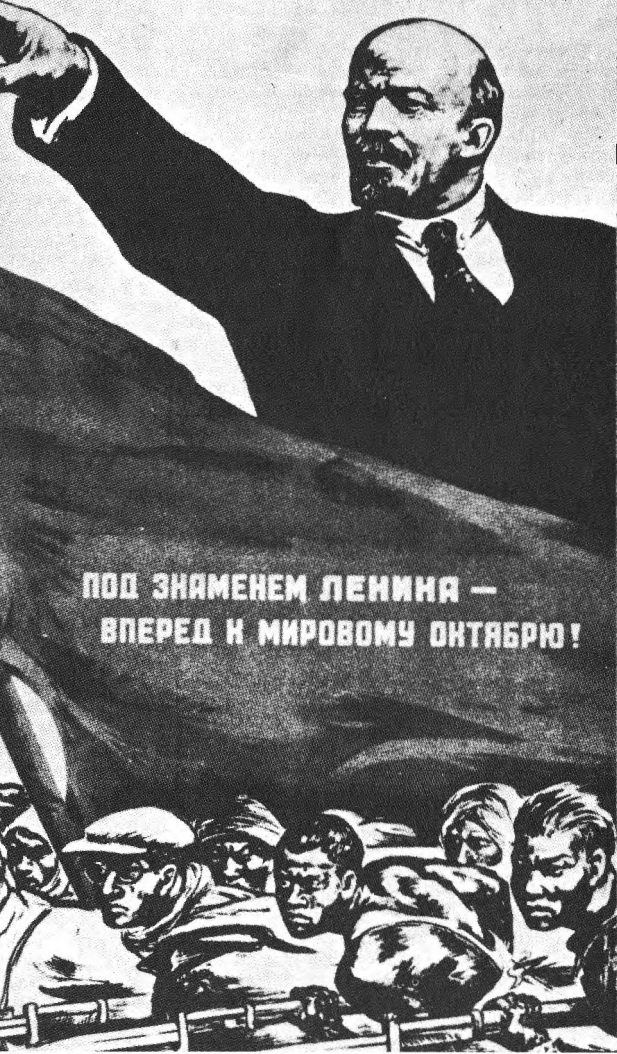
The October Revolution gave a new incentive....

very likely to happen to the other national regimes which have the same class and ideological structure. What happened with the petit bourgeoisie which gained power in Iraq? It began as anti-imperialist in 1968, and did many things for the national and popular interests. Now it is taking the same path.