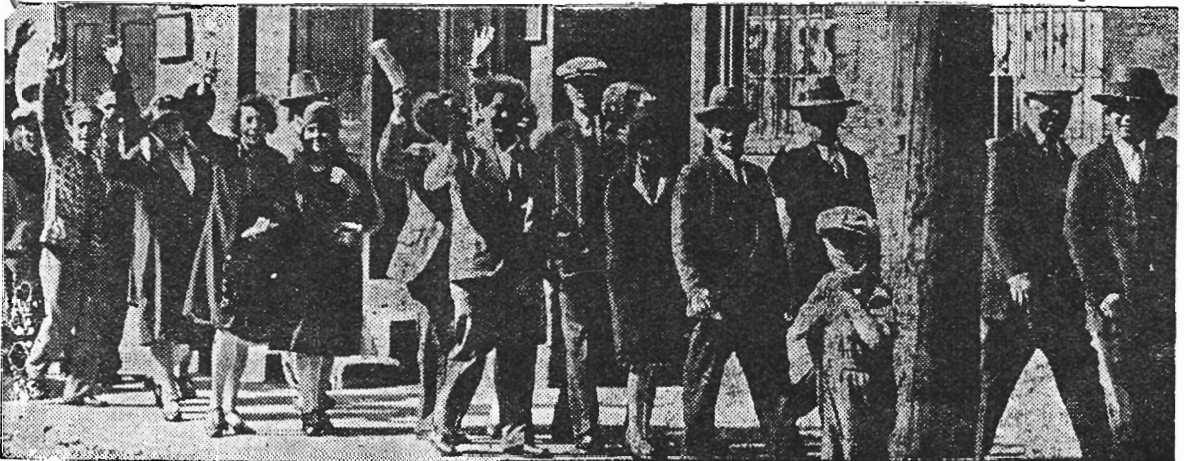
Mass picketing by Left Wing Needle Trades' workers during the recent big strike in New York City